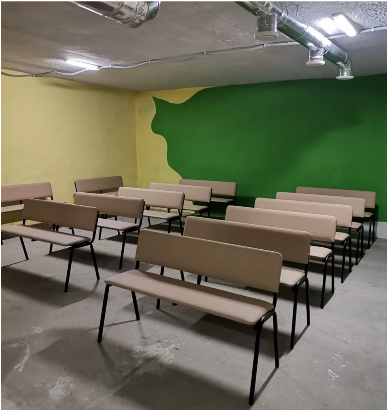
Chotyrbotskyi lyceum after renovation