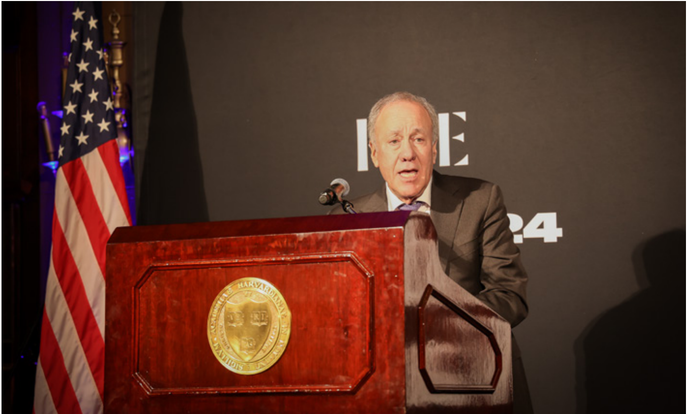
Nobel Laureate in Economics 2007, Chair of the International Academic Board of KSE Professor Roger Myerson talks at the Harvard Club, NYC, “The Ukrainian Independence War and the Future of the World”