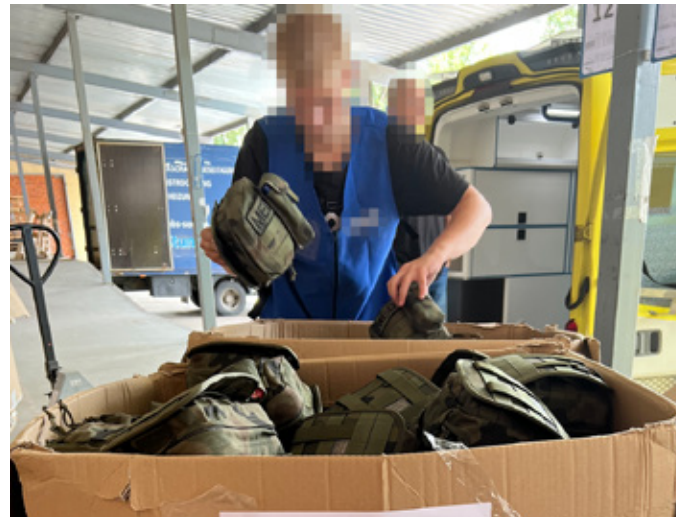
First aid kits for defenders and civilians