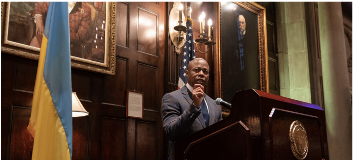
Mr. Eric Adams, Mayor of the NYC, at the KSE Event “The Ukrainian Independence War and the Future of the World”

Our first major fundraising and positioning event in the USA, The Ukrainian Independence War and the Future of the World, took place in New York in September . This event brought together a diverse group of intellectuals and experts to discuss the ongoing Independence War in Ukraine and its global implications. The event consisted of a closed-door conference and dinner and featured a range of speakers, including Nobel Laureates Paul Krugman and Roger Myerson, as well as Ukrainian military officers, surgeons, economists, and investors. The mayor of New York City, Mr. Eric Adams, also spoke at the event.