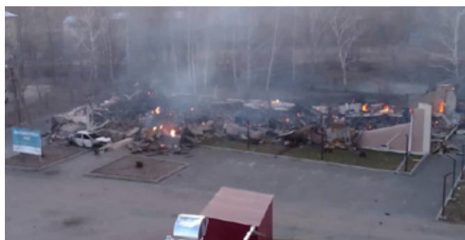
AFTER THE DESTRUCTION