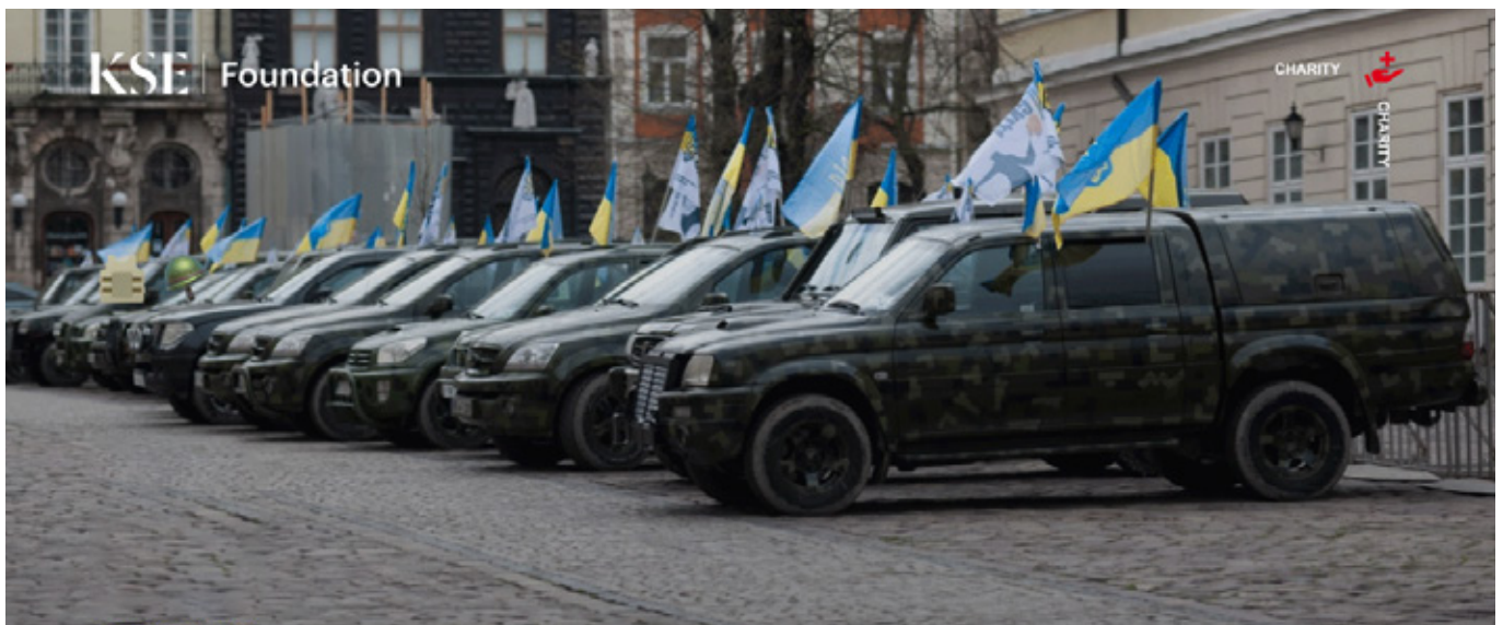
Pickup trucks for Ukrainian defenders