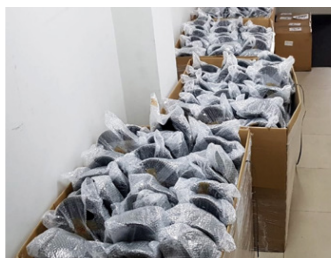
Ukrainian defenders who received protective ammunition from the KSE