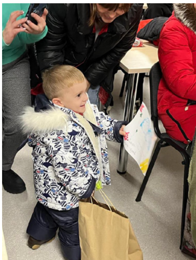
Students of Kyiv School of Economics organized New Year's Eve party for orphaned and refugee children