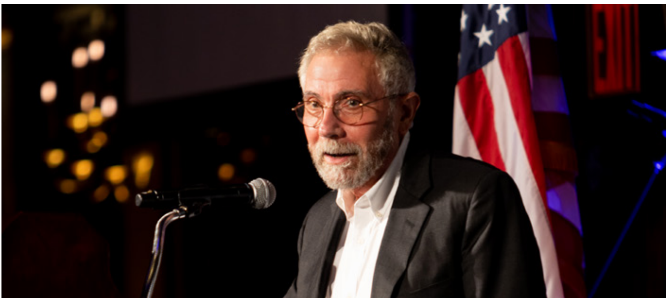
Paul Robin Krugman, winner of the Nobel Memorial Prize for Economic Science (2008), at the KSE Event “The Ukrainian Independence War and the Future of the World”