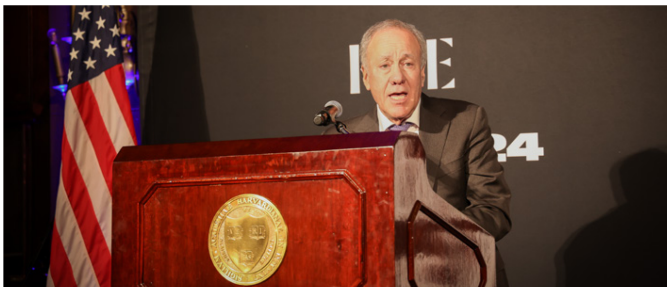
Nobel Laureate in Economics 2007, Chair of the International Academic Board of KSE Professor Roger Myerson talks at the Harvard Club, NYC, "The Ukrainian Independence War and the Future of the World"

Since the beginning of the invasion, the KSE Foundation raised $40 million for its Humanitarian relief program ("Help Ukraine"), including support for Ukrainian defenders, assistance for war-affected cities, and educational infrastructure. Approximately one-half of these funds were used to support defense and infrastructure in Ukraine, including cybersecurity, training, and the integration of innovative technologies to strengthen Ukrainian resilience. The Foundation's other major projects included retrofitting school shelters, assisting war-affected cities with the necessary equipment, rebuilding damaged medical and